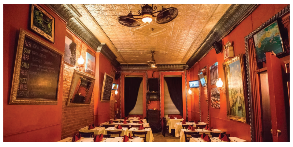
Lazzaras Pizza Cafe & Restaurant have been catering to The Fashion Industries Garment Center, New Yorkers and Tourists since 1985.